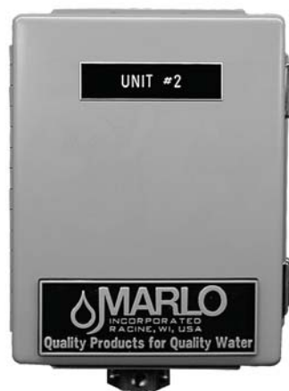
Remote Unit #2 Stager

The ALTERNATOR consists of a sequencing pilot stager integrated with the stager controllers and hydraulic diaphragm valves of the water softener system. An internal cycle timer receives a signal from an external device, such as a water meter, to alternate the softeners and cycle the exhausted softener through its regeneration.