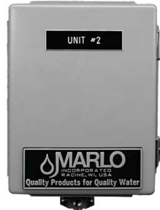
Remote Unit #2 Stager