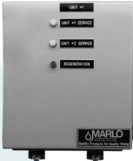
Alternator Unit #1 Stager Controller

The ALTERNATOR consists of a sequencing pilot stager integrated with the stager controllers and hydraulic diaphragm valves of the water softener system. An internal cycle timer receives a signal from an external device, such as a water meter, to alternate the softeners and cycle the exhausted softener through its regeneration.