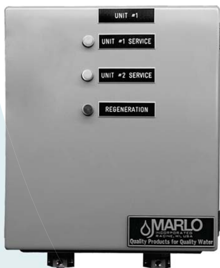
Alternator Unit #1 Stager Controller