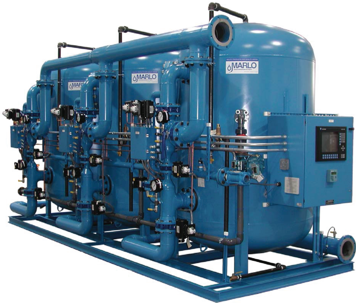
(Triple System with Skid Mount, Prepipe and Prewire Option Shown)